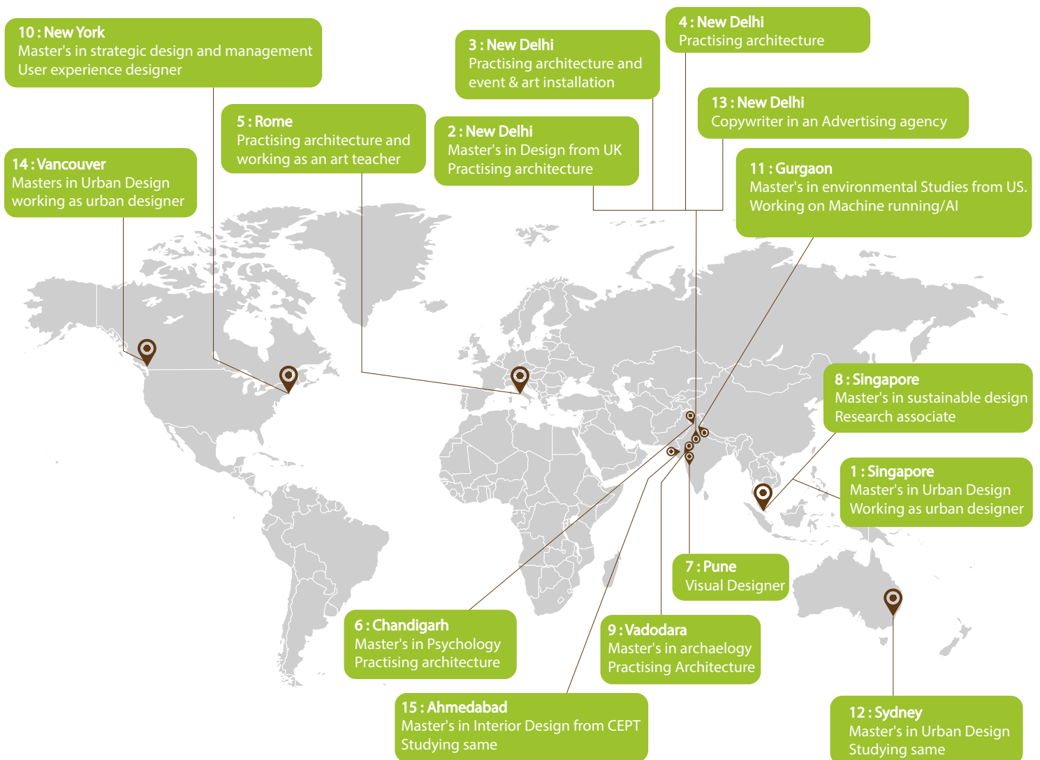
Figure 2 - Overview of participant profiles, place of residence, and current occupation.